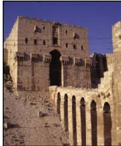
Figure 1. The Citadel of Aleppo