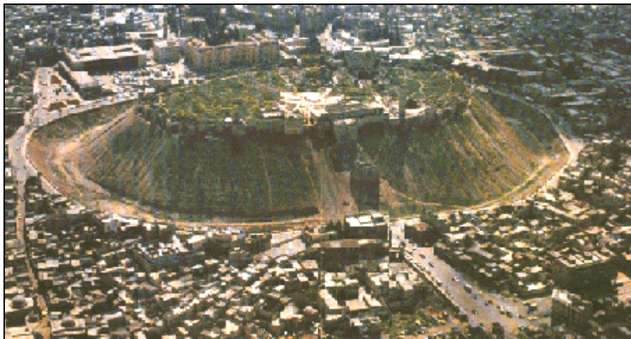
Figure 2. Old city defences, Aleppo 9

When the Muslim armies captured Aleppo in the year 16 after Hijra, Abu Udaiba, their general, entered by the Antioch gate. This is one of the imposing structures of Aleppo, a city of great sites, sites which impressed for both their majesty and their scholarly role, and also in their role for the promotion and defence of Islam, and sites worthy of a great, thriving city.