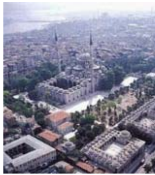
Figure 1. An overview of the Fatih Kulliye.

madrasas had waqfs (public foundations) supporting their activities. The waqfiyes (the deed of endowment of a waqf ) of important madrasas stipulated that both the religious ( ulūm al-sharia ) and rational sciences ( ulūm al-awāil ) such as mathematics, astronomy, medicine, and physics be taught in these institutions. Besides the ulema who provided religious, scientific, and educational services, the madrasas also trained the administrative and judicial personnel for bureaucratic posts. The ulema , members of the Muslim learned, cultural, and religious institution ( Ilmiye ) who played an important role in every aspect of social and official life, were recruited from the madrasas . They had a twofold duty of interpreting and implementing Islamic law; the mūftīs fulfilled the first of these duties and the qādīs (judges) the second. The ulema were responsible for applying the sharia (the sacred law of Islam) and Qānūn (Sultanic law) in the affairs of state. Starting from the reign of Mehmed II (Fātih, known as the Conqueror, 1451–1481), the number of madrasas increased considerably; to facilitate differentiation among them, they were given ranks. (For the Fatih Kulliye picture see Figure 1).