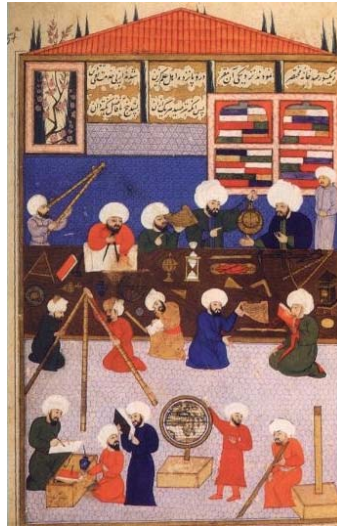
Figure 2. Istanbul Observatory and Taqi al-Din's miniature. Shahinshahnameh, Istanbul University Merkez Library, No. F. 1404.

chief astronomers. Indeed, quite a number of successful timekeepers rose to that rank. The chief astronomer appointed the timekeepers. The son of the deceased had priority, and if there were no son, a candidate would be selected by examination.