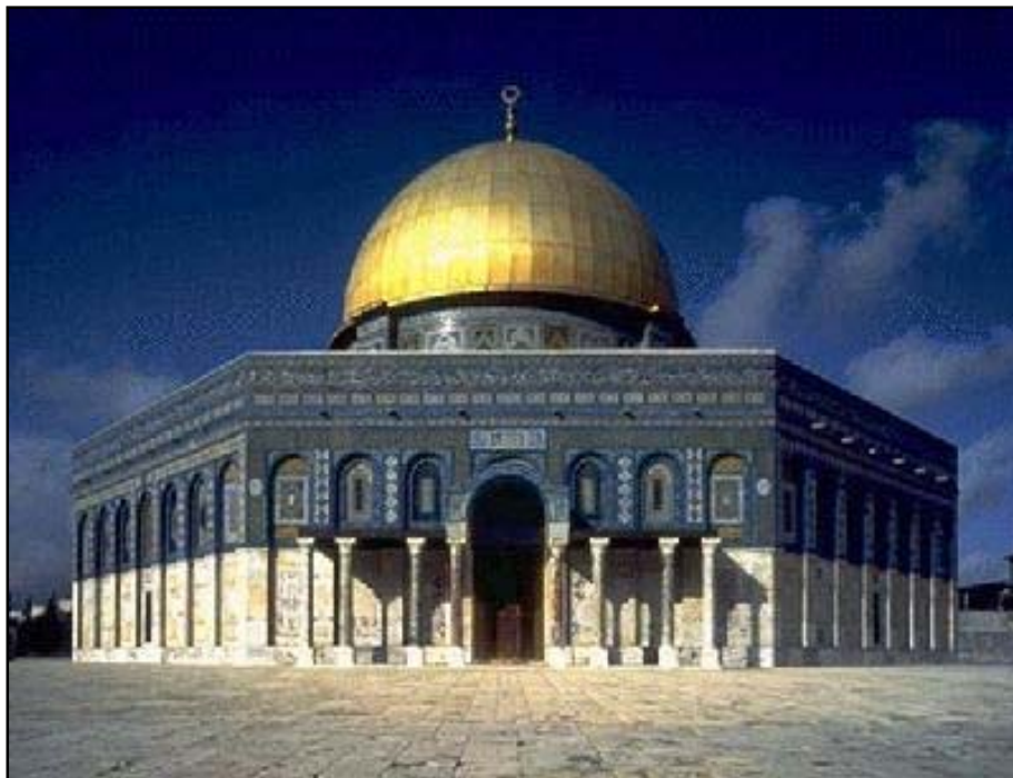
Figure 1: Dome of the Rock, the Jewel of Islam (691-692)

The Umayyad architectural splendour is experienced in both religious and domestic buildings. At the core of their religious heritage we find the Dome of the Rock, the architectural jewel of Islam and Damascus Mosque, its master piece. According to an inscription found on the building, the Dome of the Rock was built by the Caliph Abd-el-Malik between 691-692 ( figure 1 ). The Mosque forms the heart of the complex of Al-Haram As-Sharif and covers the rock " Sakhra " from where Prophet Muhammed (pbuh) ascended to heaven accompanied by Archangel Gabriel. By building the Dome of the Rock to cover the sacred " Sakhra ", Abd-al-Malik wanted to match his rival Ibn Zubayr (who rebuilt Kaaba between 683-392) in his devotion to Islam.