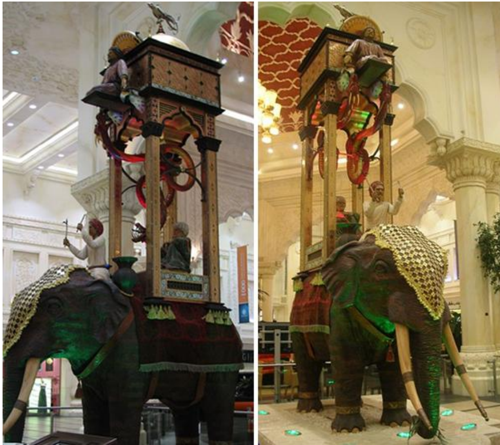
Figure 2: Two photos of the fascinating reproduction of the 8.5 meter high elephant clock of al-Jazari in the Ibn Battuta Mall, Dubai. This reproduction was designed by Muslim Heritage Consulting and FSTC. Al-Jazari's elephant clock was the first clock in which an automaton reacted after certain intervals of time. In the mechanism, a humanoid automata strikes the cymbal and a mechanical bird chirps after every hour. See: http://muslimheritage.com/topics/default.cfm?ArticleID=466 and http://muslimheritage.com/topics/default.cfm?ArticleID=188 .