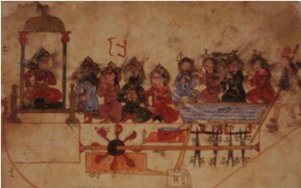
Figure 5: An illustration by al-Jazari of the internal mechanics of an automated boat: al-Jazari 1974, category II, chapter 4, p. 107. Held at the Topkapi Palace Museum Library in Istanbul, al-Jazari, Al-Jami' bayn al-ilm wa'l-amal al-nafi fi sina'at al-hiyal , MS Ahmet III 3472.

has passed (again). Then the flute player blows the flute audibly and the servant girls play the instruments, as happened the first time. They do not desist until they have performed about fifteen times” (al-Jazari, 1206/1974: 107).