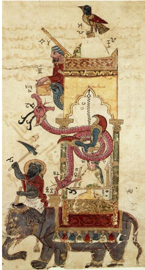
Figure 1: Elephant clock of al-Jazari, from a MS copy of his treatise The Book of Knowledge of Ingenious Mechanical Device copied in Syria in 1315 by Farkh ibn 'Abd al-Latif (Ink, colors, and gold on paper; height. 30 cm – width 19.7 cm).