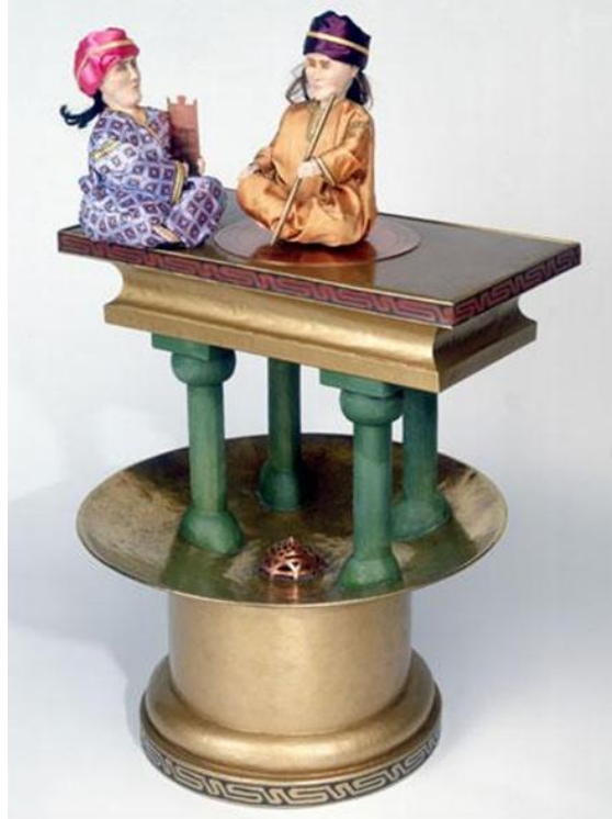
Figure 3: A creative model of a device designed by al-Jazari (chapter 6 of category III) used for measuring blood lost during phlebotomy (bloodletting) sessions, a popular therapy in the medieval world. Taken from a MS of al-Jazari's treatise copied in Egypt in 1354.

inherently unstable and capricious and had thus to be managed in complex and meticulous ways so as to create the desired effects.