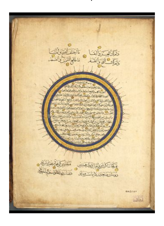
Figure 2. Traditional Turkish Calendar (1452). The traditional Turkish calendar was based on a cycle of 12 months, each corresponding to a different animal. This calendar for the year of the monkey by Hamdi Mustafa b. Sunbul was presented to Mehmed II. (Topkapı Palace Museum Library, B 309).

Some of these solar calendars were used side by side with the lunar calendar throughout Islamic history for the purpose of regulating agricultural and those administrative activities for which a solar calendar was more convenient. The Hijri takvim or lunar calendar based on the Hegira was fundamental to social and religious life, and that which principally preoccupied Muslim astronomers until the introduction of the Jalalî calendar devised by Seljuk astronomers, among them Omar Khayyam. The Jalâlî calendar was a very reliable and precise solar calendar that came to be widely used.