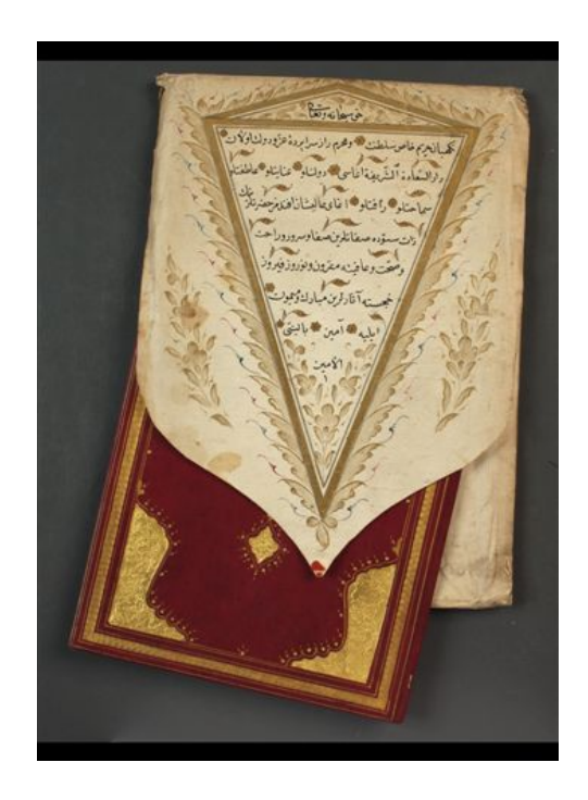
Figure 1. A cover page of an astrological Table and. Topkapi Palace Museum Library, K 1069.

For desert tribes and caravans, which kept their activity to a minimum in the pitiless heat of day, preferring to travel by night, it was natural that the moon should take precedence over the sun. The lunar calendar used by pre-Islamic Arabian tribes continued to be used, with modifications, to regulate social and religious life following the advent of Islam.