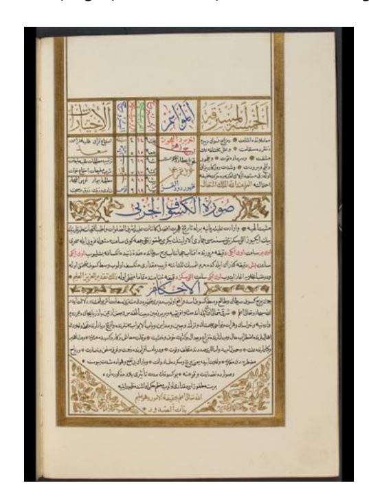
Figure 7. Almanac Page. Last page of the almanac consisting of calendar and horoscope produced by court astrologer Chief Astronomer Seyyid Sadullah Mehmed Efendi, and describing the partial eclipse and horoscope for the year. Topkapı Palace Museum Library, R 1712.

The calendar, called Nawrûz-i Sultanî (Royal New Year), which commenced on 21 March, consisted of thirteen pages. This was drawn up in the form of a Jalâli solar calendar, with a line for each of the 29 or 30 days. The thirteenth page was devoted to the five or six additional days arranged into columns, the first headed al-Arabî listing the days of the Islamic calendar, and the second headed al-Rûmi giving the equivalent days of the Rumî calendar. In this section there were also columns devoted to astrological and other information, such as predictions, signs, the seasons, events and the signs of the zodiac.