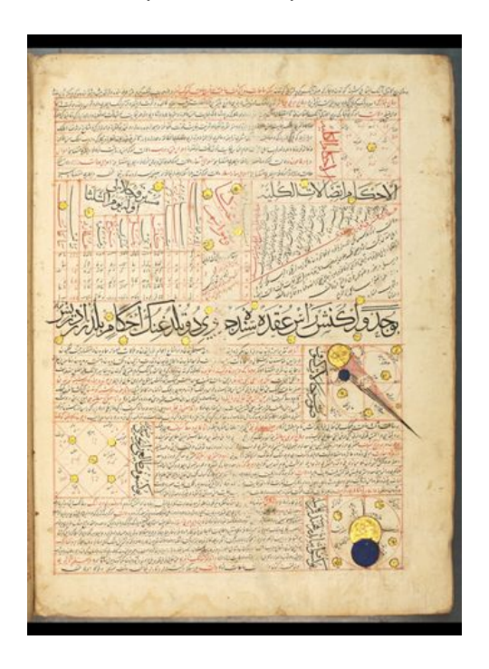
Figure 5. Almanac Page. This page from an almanac by Hamdi Mustafa bin Sunbul presented to Sultan Mehmed II describes the effects of the signs of the zodiac according to the different seasons. Topkapi Palace Museum Library, B 309.

The office of court astrologer was established towards the end of the 15<sup>th</sup> century. The astrologer, his deputy and five clerks produced almanacs annually for presentation to the sultan and statesmen, and this official institution was important for the study of astronomy in the Ottoman Empire.