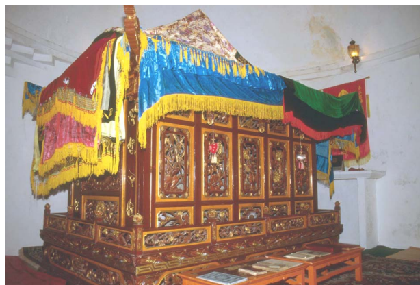
Grave of Sa'd Ibn Abi Waqqas

According to Chinese Muslim historians, Sa'd Ibn Abi Waqqas died in Guangzhou where he is believed to be buried. However Arab scholars differ, stating that Sa'd died and was buried in Medina amongst other Companions. One grave definitely exists, while the other is symbolic, God only knows whether it is in China or Medina. The message of Islam took root peacefully in China. The first envoy reached the southeast via the Zhu Jiang (The Pearl River) and was later followed by contact via an overland route from the northwest. Muslim communities are present over a wide geographical area in China today, including some in the remote places of Tibet, where I once met Tibetan Muslims in the middle of nowhere, while on a trek.