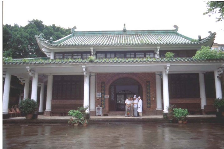
The exterior view of Prayer Hall

One year after the death of the Amir al-Mu'minin, Abu-l-Abbas as-Saffah (r. 749-54), known in China as "A-Bo-Lo-Ba", the foe became a friend of "A-p'uch'a-fo" - the second Abbasid Caliph Abu Jafar al-Mansur (r. 754-75). The Emperor Su T'sung appealed for help in regaining control of his capital Chang'an from the treacherous commander, An Lu-Shan who was a multi linguist Tarter and governor of Pinglu and who had the wildest of ambitions and had rebelled against the Emperor.