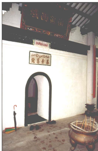
Ro'udat Abi Waqqas

Within the prosperous maritime network, merchants brought valuable and distinctive commodities such as silk, jade, porcelain, lapis lazuli, spices and fruits which were carried on the backs of camels. Silk was one of many precious goods that were exchanged between East and West due to the prosperous maritime network managed by Arabs who were acting as intermediaries between China, India and the Middle East.