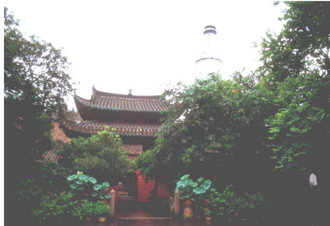
View of Pavilion and Minaret

Prior to 500 CE and hence before the establishment of Islam, Arab seafarers had established trade relations with the "Middle Kingdom" ( China ). Arab ships bravely set off from Basra at the tip of the Arabian Gulf and also from the town of Qays ( Siraf ) in the Persian Gulf. They sailed the Indian Ocean passing Sarandip ( Sri Lanka ) and navigated their way through the Straits of Malacca which were between the Sumatran and Malaysian peninsulas en route to the South China Sea. They established trading posts on the south eastern coastal ports of Quanzhou and Guangzhou. Some Arabs had already settled in China and probably embraced Islam when the first Muslim deputation arrived, as their families and friends back in Arabia, had already embraced Islam during the Holy Prophet's revelation (610-32).