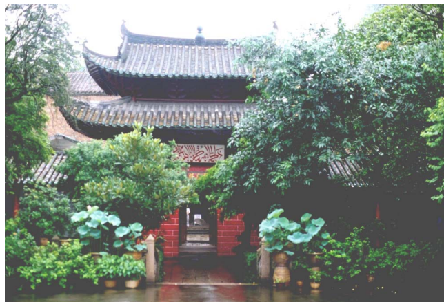
The Moon Pavilion

My first journey to China took the form of a boat ferry from Inch'on, South Korea to north China's largest port city of Tianjin, nicknamed "Shanghai of the North", where a well-known and sizeable Hui village of Tianmu lies situated on the northern city's suburbs. It took over thirty horrific hours and nervous worries of what will happen once I finally reach China.