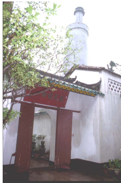
Gateway to the Mosque

The mosque gave birth to a new chapter in the field of architecture in one of China's most illustrious periods of history where efficient administrative system developed, printing appeared for the first time, custom and philosophy became even more sophisticated and creative arts flourished, producing a highly cosmopolitan empire.