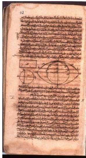
Figure 5. A sample page of Sabit b. Kurra's manuscript Kitāb fuzū'al ustuwana wa natstabiha. Suleymaniye Library, Ayasofya 4832.

The mathematical works of Mūsā al-Khwārazmī were the chief text books used in European universities up to the seventeenth century. He is, in the words of ʿAli 'Abdullah Al-Daffa, 20 the founder of algebra and had transformed the concept of a number from its earlier arithmetic character as a fixed quantity into that, of variable element in an equation. He also found a method to solve general equations of the first and second degree in one unknown by both algebraic and geometric means. 21 It was through his work on mathematics that the Indian system of numeration was known to the Arabs and later through its Latin translation to the people of Europe. He synchronized Greek and Indian mathematical knowledge but was the first mathematician to distinguish clearly between algebra and geometry and gave geometrical solutions of linear and quadratic equations.