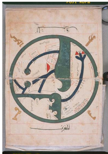
Figure 6. The world map of al-Idrisi., Ahmad b. Sahl Al-BALhī, Akālim al-buldān, Suleymaniye Library, Ayasofya 2577.

geographical regions; the sixth, rivers (giving their salient points and towns on them). 22 This book had served as a basis for later works and stimulated geographical studies and the composition of original treatises. It is said that his Kitāb Sūrat al-Ard was also accompanied by regional maps of each of the climes and by a single world map called "al-Sūrat al-Ma'muniyya" but have been lost. It is also said that his map of the world was the first map of the heavens and the world drawn by Muslims. But the editor of the Kitāb Sūrat al-Ard Hans von Mzik, has produced only four maps. These four maps, in the words of S. Maqbul Ahmad, 23 seem to be later recessions of the original maps. But Ibrahim Shawkat 24 reasons that since Al-Khwārazmī wrote a brief work on geography, he did not draw a complete map of the world but confined himself to draw only the four maps as an illustration. His source of inspiration might possibly have been the mappa mundi 25 constructed for Caliph Al-Ma'mun by a team of geographers in which Al-Khwārazmī himself would have been included 26 .