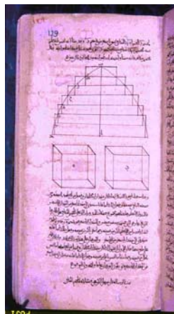
Figure 2. A sample page of Suhayl al-Kūhī's manuscript Risāla-i Abi Sahl or Fi istihraci masaha al-muhassama al-mkāfi . Suleymaniye Library, Ayasofya 4832.