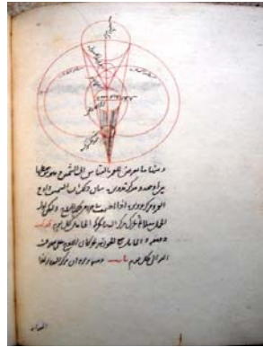
Figure 3. A mathematical figure from Ali Kuscu's book Risāla al-Fathiyya fi ilmi'l-Hay'a . Süleymaniye Library, Ayasofya 2733.

equals 5 of its roots." 16 For the second power of a quantity he employs māl (wealth, property) which is also used to mean only "quantity" and dirham is used as unit of coinage.