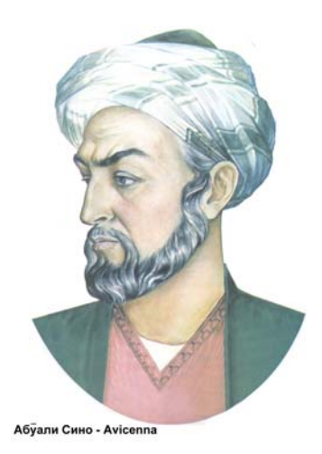
Figure 2. Ibn Sina or Avicenna (980-1037) was the most influential of all Islamic philosopher-scientists. He wrote on medicine as well as geometry, astronomy, arithmetic and music (The image was introduced by the editor).

4-3 This spirit, together with the great appreciation of Islam of <sup>c</sup>ilm, made the Islamic mentality an open one seeking knowledge "even in China", and accepting it irrespective of nationality, race or religion. Thus when Arabs mixed with other people, Muslims rushed to accomplish the greatest translation and transfer move in history, to collect and collate the scientific heritage of all humanity and conserving it from extinction. In the climax of this move, in the golden age of the Abbasid dynasty, many non-Muslims and non-Arabs contributed as translators and scientists, such as Ibn Masawayh and Hunayn Ibn Ishaq, the