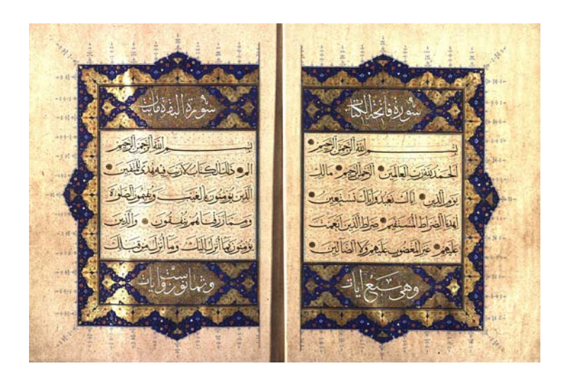
Figure 3. A page from an early manuscripts of the Quran (The image was introduced by the editor).