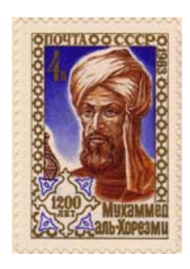
Figure 1. Al-Khwârazmî, (about 790 - about 840), the Muslim scholar who is credited with establishing the science Algebra and whom the word "algorithm" is derived from his name (The image was introduced by the editor).