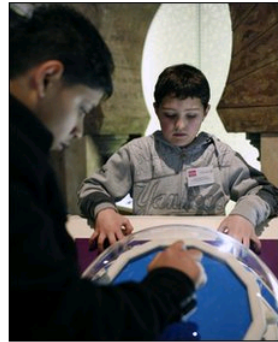
Young people took the chance to explore the interactive exhibits

The free exhibition runs from 21 January to 25 April with a break between 25 February and 12 March.