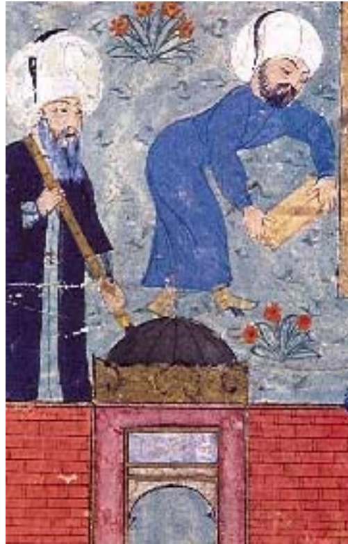
Figure 3. Sinān depicted preparing the grave of Suleyman the Magnificent.