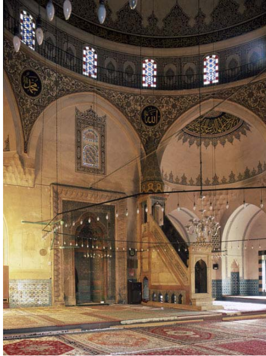
Figure 9. Behram Pasha Mosque, Diyarbakir, Turkey; interior view looking southwest towards qibla wall.