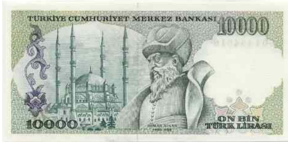
Figure 1. Sinān on an old Turkish banknote.