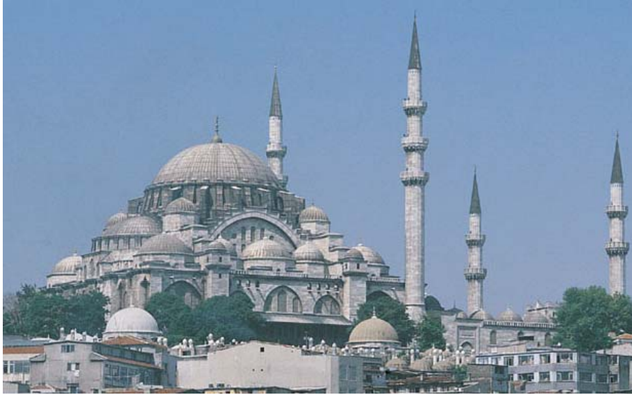
Figure 6. The Süleymaniye Complex in Istanbul; distant view from Tahtakale, with residential neighborhood on hillside. The image built by the Süleymaniya Mosque greatly emphasised the Muslim identity.

On city level, the enormous size and height of these buildings as well as the combination of domes and minarets stretching into the sky in a majestic fashion offered the right means for Sinān's symbolism. The overall picture, therefore, as summarised by Petruccioli is that " Sinān demonstrates how it is possible to 'make urbanism' with architecture by marking out few nodal sites which exalt the 'genius loci' ". 20