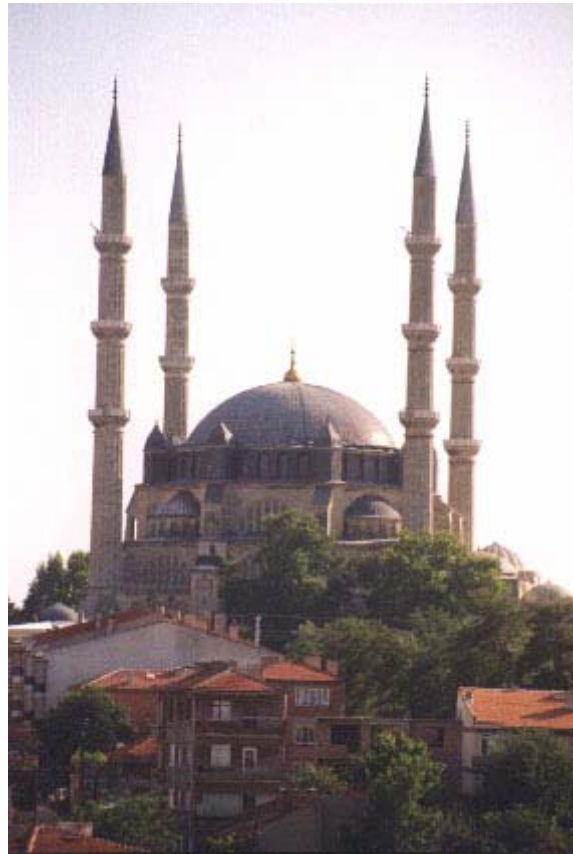
Figure 5. Selimiye Mosque or Mosque of Selim II at Edirne (Turkey) was considered by Sinān to be his masterpiece.

There is a debate whether there has been some influence exchanged between the Italian Renaissance architects and Sinān. We could see many of Sinān's features in a number of Italian churches. The above two cities, in particular, had stronger relations with the Muslims of North Africa and the East more than any other European city. Works such as those of Cola da Caprarola (1508-1604) in Santa Maria della Consolazione at Todi (16 th century) and Andrea Palladio in Church of Il Redentore (Italy, 1577-92) greatly contributed to the evolution of large domed churches in Italy and Europe. Sinān's vision could be seen in the centrality of the dome and space proportions. In the latter building one finds even Sinān's slender cylindrical minarets being added to balance the structure. Such an issue needs further investigation beyond this brief account. It is worth emphasising, however, that while no Italian architect built more than a few domed structures, Sinān is credited with over four hundred as noted previously.