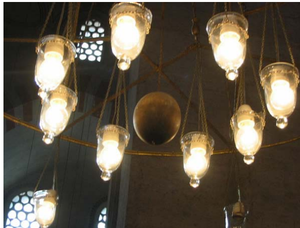
Figure 8. The oil lamps and candles used by Sinān respected environmental rules.

The oil lamps and candles, that were used in large numbers to lighten Sinān's huge buildings would generate smoke and burn oxygen, so he made use of aerodynamics to drive the smoke to a filter chamber. The soot was then collected and used for making ink. In turn, clean air was driven to the outside ensuring sustainability.