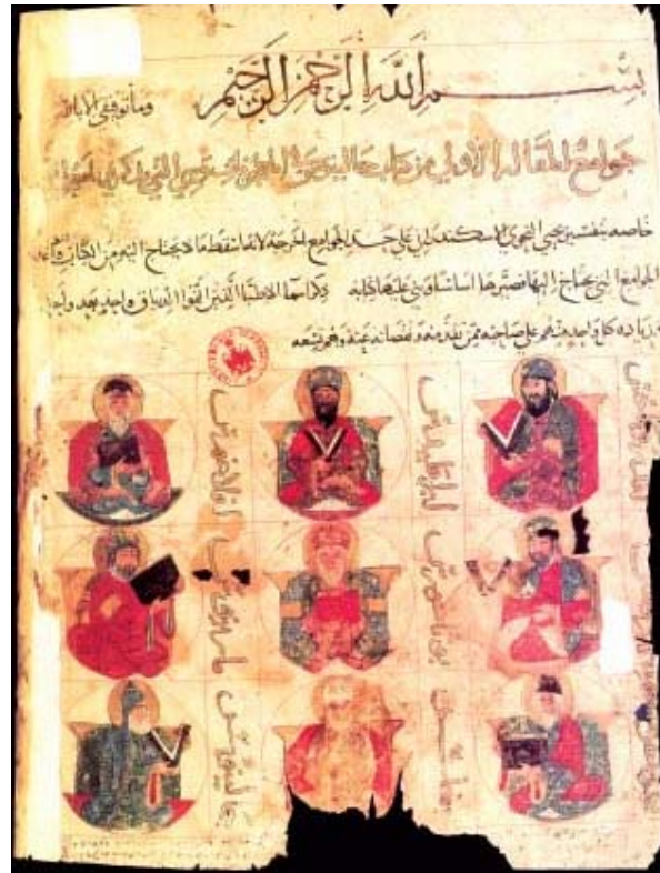
Figure 1. Names and portraits of Greek physicians on the opening page of an Arabic medical manuscript written in the region of Mosul (Iraq) between 1220 and 1250.

Thirdly, many of the ideas of the European Renaissance philosophy are based on ancient Greek, Persian and Indian texts, which the Muslims translated, as well as the philosophy of the Muslims themselves. The Muslims were responsible for creating the foundation for the "building" of philosophy that the Renaissance thinkers would later "construct."