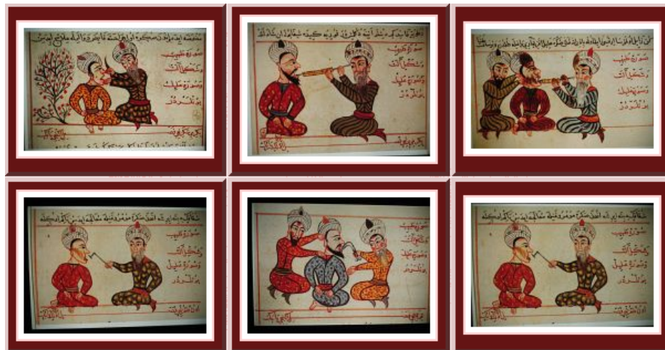
Figure 3. Miniaturised pages of a treatise of surgery that the Ottoman physician Sharaf Ed-Din wrote around 1465.

f. Medical Regulation: Before the Muslims, medicine had been an unregulated profession, where one could easily fall into the hands of an unqualified doctor. However, the Muslims' introduction of regulation ensured that all doctors were qualified. Prophet Muhammad said: " He who practices medicine and is not therein versed is deemed like a guarantor ". The regulations also ensured that doctors did not cheat their patients when it came to drug composition. The concept of medical regulation affected the Renaissance's physicians for it set an example for them, leading them to found various medical associations and guilds for the purpose of regulating their profession too. Hence, one could say that the Muslims' regulation of medicine lead to a safer and more professional medical institution during the Renaissance, which doubtlessly saved countless lives that would have been lost due to medical incompetence.