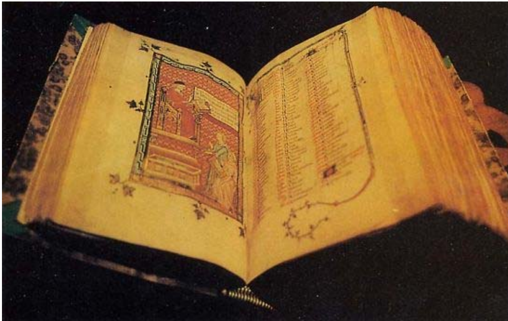
Figure 4. Latin translation of Ibn Sīnā's al-Qānūn fit'tibb: Liber Canonis (around 1320).

- Ibn Sīnā (Avicenna) was honored in the West with the title of the ' Prince of Physicians '. Ibn Sīnā's works also had a significant impact on the Renaissance. Firstly, his Canon of Medicine was the most widely studied work of medicine in Europe from the 12 th to the 17 th century. It also served as a chief guide to medical science in European universities. Needless to say, the impact of this book on Renaissance science was enormous, as it was a major source of medical information. Ibn Sīnā's discovery that certain diseases could be spread through water and soil affected the research of many Renaissance physicians. Since they knew how the disease was transmitted, it made their job of finding cures for diseases much easier. It also provided a base for their studies into how disease was spread.