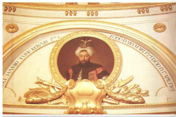
Figure 10. Portrait of Abdülhamid I on the walls of Gripsholm Castle, Sweden.

were brought from France by ambassadors Mehmed Celebi and Said Efendi. Grand Vizier Ibrahim Pasha requested the French Ambassador Marquis de Bonnac to acquire from France engravings and architectural drawings, most of which were related to the Versailles Palace, have been influential in the buildings constructed during the Tulip Period. The Sadabad Palace, which started to be constructed at the Golden Horn in 1722, with its springs, fountains and cascades, could rival the French palaces. No doubt, the European influence on Ottoman architecture increased even more after the Tulip Period. However, the traces of the baroque and rococo styles prevalent in Europe appeared mainly in architectural decoration.