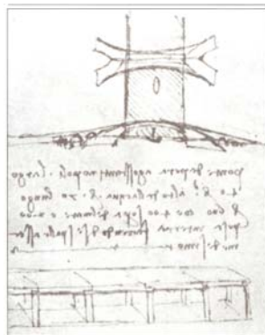
Figure 4. Leonardo da Vinci's project for a bridge over the Golden Horn. The Notebooks of Leonardo da Vinci , vol. 1, 387.

Mehmed II's successor, Sultan Bayezid II, did not seem to share his father's interest in European painting, but he was aware of the activities of Italy's masters and requested architectural and engineering services from some of them. Leonardo da Vinci wrote a letter to the sultan making a proposal for a floating bridge on the Golden Horn. In fact, the drawing of such a bridge project is found in Leonardo's notebooks. 17 Michelangelo also prepared a model for the same bridge and he even considered coming to Istanbul. 18 Sultan Bayezid II, unlike his father, did not have an interest in portraits. However, it is interesting to note the first series of Ottoman sultan portraits was produced in Europe during his reign. This series of portraits ending with Bayezid II, is attributed to Felix Petancius, who painted the portraits by relying on the information provided by the Hungarian Embassy delegation that came to Istanbul in 1495. In this series, in scroll form, portraits of the first seven Ottoman sultans up until Sultan Bayezid II are placed in medallions. 19 Such examples prove the growing interest in Europe in the Ottoman sultan portraits after Sultan Mehmed the Conqueror.