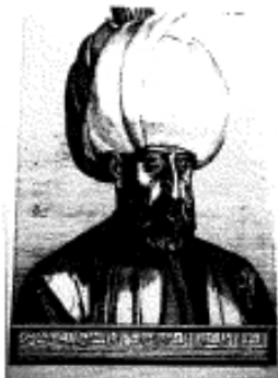
Figure 5. Portrait of Suleyman the Magnificent by Melchior Lorichs, Royal Library, Copenhagen.

Suleyman the Magnificent is one of the Ottoman rulers most frequently portrayed in Europe. Undoubtedly, this is because of the significant role he played in European politics throughout his reign for forty-six years. Suleyman's alliance with Francois I, who was defeated by the Habsburgs in 1526 and his Hungarian