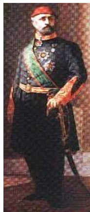
Figure 14. Portrait of Sultan Abdulaziz painted by the French artist P.D. Guillemet, Topkapi Palace Museum, 17/943.

In the Ottoman capital a large number of European architects and artists worked for the Ottoman sultans during the second half of the nineteenth century and they made projects for the Ottoman sultans who commissioned them, satisfying the demands and tastes of the sultans. Sultan Abdulaziz and Sultan Abdulhamid also formed a collection of European paintings at the palace. Moreover, Sultan Abdulhamid even established a museum 69 at the Yildiz Palace and displayed paintings. Operas of the European composers were staged at the Yildiz Palace theatre. The Ottoman palace and the Ottoman capital had become an important centre for European culture and art as well.