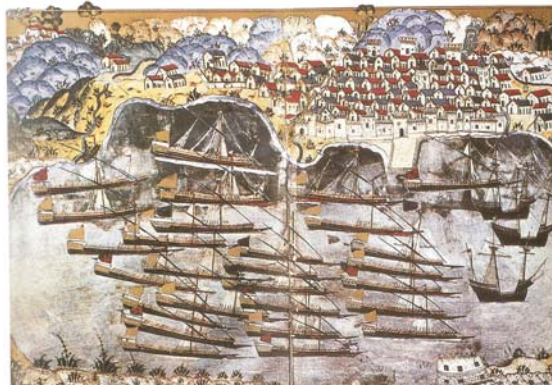
Figure 6. The Port of Toulon, painted by Matrakci Nasuh, Suleymannâme, ca. 1545, Topkapi Palace Museum, H 1608.

Suleyman the Magnificent's relations and political alliances established with France left deep marks on both sides. The Ottoman-French alliance mentioned above provided for the Ottomans expansion and sovereignty in the Mediterranean. The sea campaigns of the Ottomans initiated the Ottoman science of geography. Undoubtedly, the Ottomans were also using the Portuguese, Catalan and Italian maps that reached the Ottoman capital. In fact, Piri Reis, the famous cartographer of the period, made his world map, which is now lost except for a fragment, by using Christopher Columbus' map, and therefore, is an important product of the cultural exchange in the Mediterranean. He also wrote his Kitab-i Bahriye (Book of navigation) in this milieu. The city views in Kitab-i Bahriye are the forerunners of Ottoman topographical