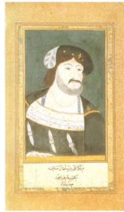
Figure 7. Portrait of François painted by Ottoman artist Nigari, ca. 1540's, Boston Fogg Museum 85. 214.

paintings that developed as a separate genre. 27 Matrakci Nasuh, the famous historian and miniature artist of Suleyman's period, while describing the Sultan's Hungarian campaign and Admiral Barbarossa's Mediterranean campaign, drew the different states in these campaigns, the cities, towns and ports and documented the topography of these regions. In other words, from then on images related to Europe were encountered in Ottoman painting. Haydar Reis (Nigari), another miniature artist in the same period, not only portrayed the sultans, but also painted portraits of King Charles V and King Francois I, the two leading European rulers. 28