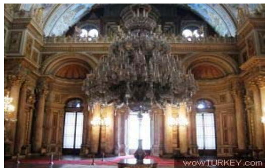
Figure 13. Reception room in the Dolmabahce Palace, Istanbul 1853.

The Ottoman-European relations followed a different line in the nineteenth century. While further achievements were taking place in science and culture in the gradually industrializing Europe, the Ottoman Empire continued its significance as a profitable market for the Europeans. This was a period in which westernization in the Empire became institutionalized. The Ottomans, who had established permanent embassies in Europe after Sultan Selim HI, improved their diplomatic and commercial relations. Especially after the 1839 Tanzimat Firman (Noble Reform Script), it is observed that Europeans and non-Muslims became influential in commercial and cultural life in the Ottoman capital city and the major cities in the provinces. All the European styles were now adopted, both in architecture and in the art of painting. The palaces constructed in Istanbul one after the other such as the Dolmabahce, Beylerbeyi, Goksu, Ciragan and Yildiz, which the sultans wished to see as the symbols of westernization, are quite different from the traditional palaces. These buildings display an eclectic style, a blend of the neo-baroque, neo-classical or even neo-gothic styles in the nineteenth century European architecture.