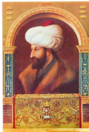
Figure 3. Portrait of Mehmed II painted by Gentile Bellini, London National Gallery.

who came to the Ottoman palace. This Venetian medallist stayed in Istanbul in the mid-1470s and struck medals with portraits of the Conqueror. 11 After the peace agreement made with Venice in 1479, political and cultural exchanges with the Venetians had increased. The sultan asked from the doge of Venice for a bronze caster who could make medals and a painter. Gentile Bellini came and worked for the sultan in Istanbul, struck a medal with the sultan's portrait and produced other portraits and city views. Moreover, it is thought that the Sultan sent this medal to Lorenzo dei Medici with whom he had good relations. Mehmed II had arrested in Istanbul the leader of the Pazzi uprising against the Medicis. 12