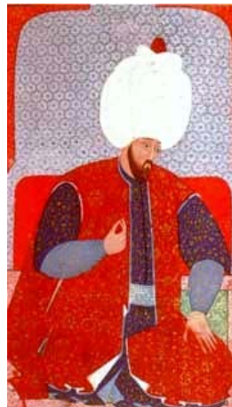
Figure 8. Portrait of Sultan Süleyman painted by painter Osman, 1579, Kiyafat al-insaniya fi shemâil al-Osmaniya , Topkapi Palace Museum H 1563.

An interesting example of the cultural exchange with Europe is the order placed by the grand vizier Sokollu Mehmed Pasha through the Venetian balio in Istanbul, during the reign of Sultan Murad III Sokollu, who must have seen the illustrated dynastic histories in Europe, wished to have a manuscript similar to these produced and commissioned the official court poet of the period and the renown miniature artist Nakkas Osman, to prepare a book containing the information related to all the Ottoman sultans illustrated with their portraits. He thought that it would be proper to refer to sultan portraits in Europe for the images of the earlier sultans. Sokollu Mehmed Pasha, who heard that such a series existed in Venice, asked the Venetian balio to have these brought to Istanbul. These oil portraits produced in the Veronese workshop, reached Istanbul in 1579 and most of them are still kept at the Topkapi Palace Museum. 32 Osman, used this series and also referred to certain historical texts, studied the authentic costumes of the previous sultans kept at the palace or in their mausoleum and then drew the portraits of the twelve Ottoman sultans from Sultan Osman through Sultan Murad III. Osman did not use the bust form in these portraits.