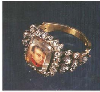
Figure 12. Ring with portrait of Napoleon presented to Selim III, Topkapi Palace Museum 2/3699.

The Ottoman-European relations followed a different line in the nineteenth century. While further achievements were taking place in science and culture in the gradually industrializing Europe, the Ottoman Empire continued its significance as a profitable market for the Europeans. This was a period in which westernization in the Empire became institutionalized. The Ottomans, who had established permanent embassies in Europe after Sultan Selim HI, improved their diplomatic and commercial relations. Especially after the 1839 Tanzimat Firman (Noble Reform Script), it is observed that Europeans and non-Muslims became influential in commercial and cultural life in the Ottoman capital city and the major cities in the provinces. All the European styles were now adopted, both in architecture and in the art of painting. The palaces constructed in Istanbul one after the other such as the Dolmabahce, Beylerbeyi, Goksu, Ciragan and Yildiz, which the sultans wished to see as the symbols of westernization, are quite different from the traditional palaces. These buildings display an eclectic style, a blend of the neo-baroque, neo-classical or even neo-gothic styles in the nineteenth century European architecture.