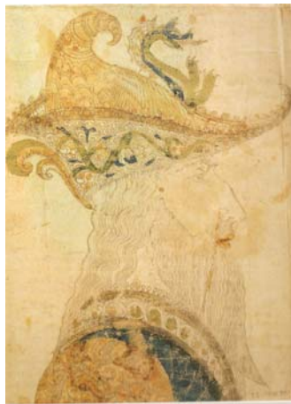
Figure 2. Portrait of Mehmed II inscribed El Turco , shown in the attire of the Byzantine king Johannes Paleologus, ca. 1460, Topkapi Palace Museum H 2153.

Mehmed II's personality, politics and his interest in the Western world led to the spread of the image of the Turks in European art. The first portrait of the sultan produced in Europe has the inscription El Turco and it is based on the image of the Byzantine emperor Johannes Paleologus found on a medal struck on the occasion of the council that convened in Florence in 1438 with the purpose of uniting Eastern and Western churches. 8