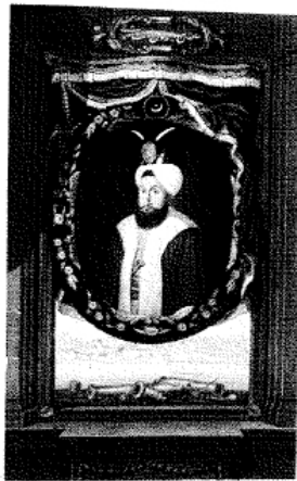
Figure 11. Portrait of Selim III painted by Constantine Kapıdađlı and engraved in London, dated 1793, Topkapi Palace Museum, A 3689.

The most important development observed in the Ottoman painting in this century is the introduction of canvas paintings. All of the sultans who reigned during the second half of the eighteenth century had their portraits painted in oil on canvas. Moreover, starting with Sultan Selim III, the sultans distributed their own portraits. Sultan Selim III, who realized that the rulers in Europe exchanged their portraits as gifts, had his own portrait engraved and distributed it to the high dignitaries in the Empire, the European rulers and ambassadors.