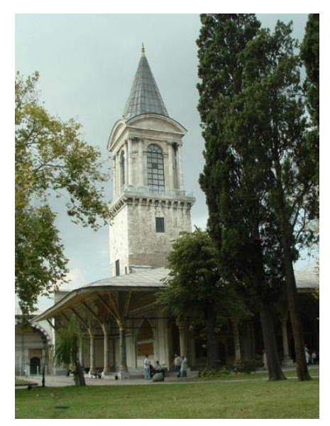
Figure 3. Justice Tower of Topkapi Palace, Istanbul.