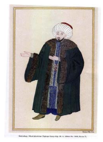
Figure 2. Chief Physician (Topkapi Place Museum Library).

The Ottoman doctors inherited the concept of classical medicine based on Islamic sources and wrote works that include their own experiences. However, they were also aware of the then developing modern medicine in Europe, and followed it closely. Beginning in the 18<sup>th</sup> century they translated some of the newly written medicine books in Europe. It is, however, only in the last quarter of the 19<sup>th</sup> century they caught up to the age of modern or scientific medicine. While maintaining classical Islamic medicine on the one hand, the Ottoman doctors translated modern European medicine and tried to incorporate both. Abbas Vesim b. Abdurrahman Efendi (b.1760) is the leading doctor, in this context, who carried out serious studies and produced outstanding works. His Dusturu Vasim fi tibb al-jadid wa'l-kadim, Vasilat al matalib fi ilm al-tarakib<sup>14</sup> and Tibb-i Kimya-i jadid are among those written in this subject and in their bibliographies both Islamic medicine books and that of Europe were cited.