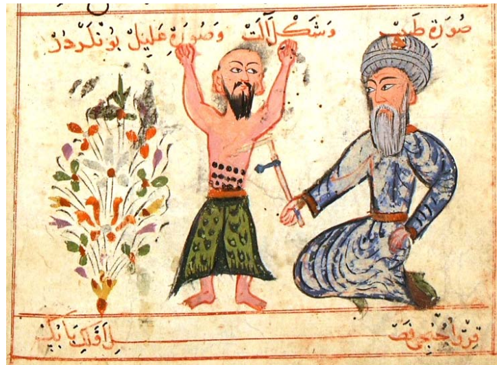
Figure 4. A medical treatment miniature from Sharaf al-Din Sabuncuoglu's book Jarrahyyat al-Haniya (The image was introduced by the editor).