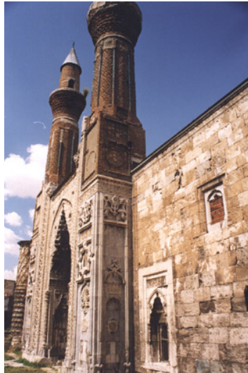
Figure 3. Amasya Gokmadarasa (The image was introduced by the editor).

Amasya, Anbar bin Abdullah Hospital (Dar al-shifa) (708 H/1308-9): It was built during the era of the Ilhanı ruler Olcayto Mahmad, around the years 1308/09, by Anbar bin Abdullah, the slave of princess Yildiz Hatun. The hospital was built on the side of the road next to the Yesilirmak river and its dimensions were 24.58x32.90m using a madrasa plan and with an antechamber and ten rooms.