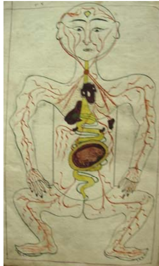
Figure 1. A pregnant woman miniature from Mansur b. Muhammad b. Ahmad's book Tashrih Badan al-Insan (The image was introduced by the editor).

disabled in Musul (1159). Additionally the vizier Kunduri, on order of Tugrul Bey restored hospitals such as the Adud al-Dawla in Baghdad. 9 They also created field hospitals for the military, where doctors, medical personnel, wounded, medicines and medical supplies were carried by camels. 10