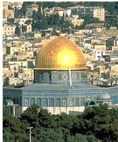
Figure 1. Dome of the Rock 21

Medina and Damascus the aim appears to have been to create monuments that would proclaim the power and ideals of the new Islamic state. 17 Even richer and more complex was the decorative and epigraphic program of the Dome of the Rock in Jerusalem, built by Caliph 'Abd al-Malik and completed in 691/692CE. 18 From its plan—a central domed area over the rock proper and a double octagonal ambulatory around it—the commemoration of the rock appears to be the building's main purpose; a door placed where the mihrab should be demonstrates that it was not intended for use as a mosque. 19 Both the inner (circular) and outer (octagonal) zones are formed of piers alternating with columns. Internally the building is notable for its colourful decoration: marble panels on the piers and lower wall surfaces; and mosaic cubes on the arcades of both zones as well as on the drum of the central dome. 20