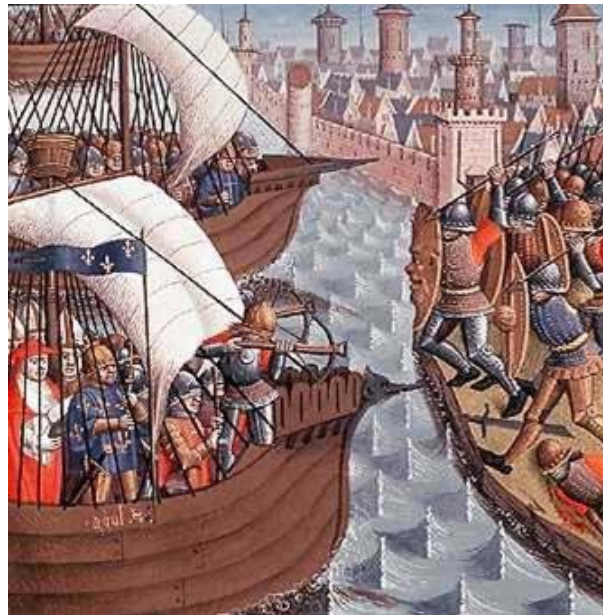
Figure 5. Crusaders 105

crusades themselves had great dreams of making fortunes in the East. Godfrey of Bouillon, one of the principal leaders, was accompanied by a brother, Baldwin, and another leader, Bohemond, was joined by a nephew, Tancred. They hoped to make their fortunes overseas. 104