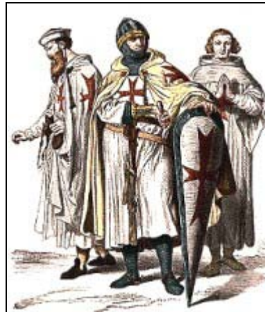
Figure 4. The Knight Templars 89

In truth, there were no Turkish atrocities and defilements of the Holy sites; far from being in danger of extermination, the Christians enjoyed a uniquely favourable status under Muslim rule. In 1047 the Muslim traveller Nasir-i-Khosru, having seen Christians freely practicing their faith, described the Church of the Holy Sepulchre as 'a most spacious building, capable of holding 8000 persons, and built with the utmost skill. Inside, the church is everywhere adorned with Byzantine brocade, worked in gold.' 87 This was but one of many Christian churches in Jerusalem. Christian pilgrims had free access to the holy places. 88