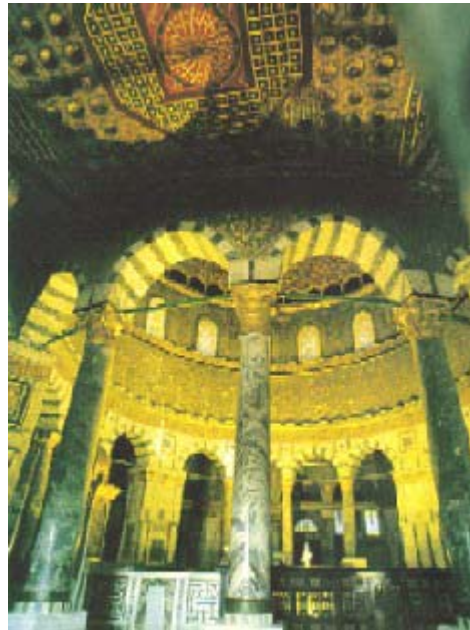
Figure 3. The Dome of the Rock, Inside 39

Abu Hamid al-Ghazali was born at Tus in 1058, lost his father at an early age and was reared by a Sufi friend. He studied law, theology and philosophy; he spent much of his life teaching and writing and he would stay in Jerusalem, Damascus and Baghdad. At thirty-three he was appointed to the chair of law at the Nizamiya College in Baghdad where he taught. Soon all Islam acclaimed his eloquence, erudition and dialectical skill. 37 After four years of this glory he was laid low by a mysterious disease; appetite and digestion failed, paralysis of the tongue occasionally distorted his speech and his mind began to break down. 38