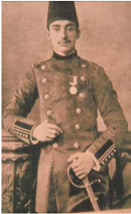
A distinguished physician as well as a good economist and an extraordinary organiser.