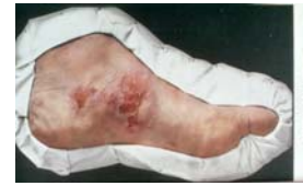
Wax model of a foot showing tinea pedis.

He studied the dermatomycotic infection known today as tinea pedis et manuum and described its agent, prognosis, differential diagnosis and therapy and named it as "trichophysis".