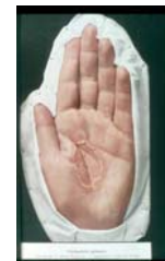
Wax model of a hand showing Trichophytie