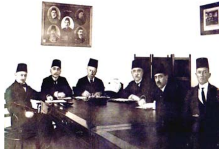
At the Turkish Red Crescent board meeting

He was distinguished by his simple and practical approach in his clinical education of medical students. The following phrase which he insistently repeated to his students during bedside visits, well demonstrates the importance he gave to clinical observation and practice: