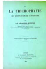
His article describing tinea pedis et manuum