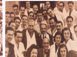
With his colleagues and students