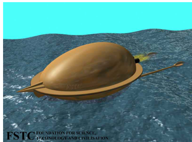
A conceptual model of the floating rocket described by Hassan Al-Rammah 3 , created by FSTC Ltd.

Ley 4 "But Hassan Al-Rammah adds one unsuspected novelty: a rocket-propelled torpedo consisting of two flat pans, fastened together and filled with powder or an incendiary mixture, equipped with a kind of tail to insure movement in a straight line, and propelled by two large rockets. The whole was called the "self-moving and combusting egg" but no instances of its use are related"